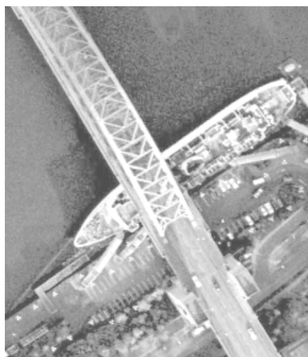
FIG. 2 A ship moored under the Tyne Bridge in Newcastle.

If you have a project which can use the historical or aerial photography data, and you are located in any of the six universities mentioned above, please let us know.