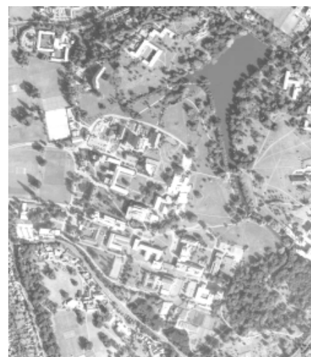
FIG. 3 University of Reading campus.