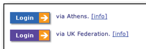
EDINA login buttons