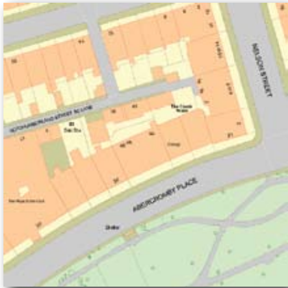
OS MasterMap image

MasterMap data is replacing the current Land-Line.Plus data. It has significant advantages over Land-Line and will bring Digimap users many benefits.