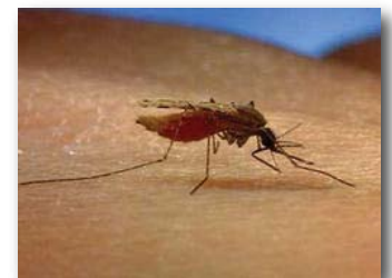
Anopheles: Blood-sucking female mosquito

Stills from a selection of IWF films in Film & Sound Online.