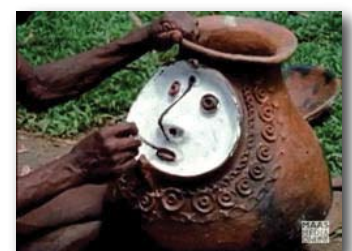
Aibom (New Guinea, Middle Sepik) - Painting a Sago Jar