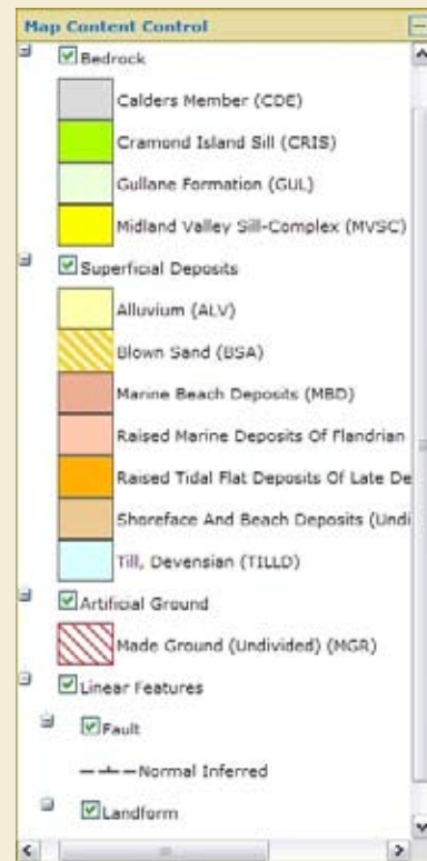
Fig. 1: Map Control panel

The data available through Digimap is the property of the British Geological Survey, and is protected by copyright. The licence allows you to use maps and data from Digimap in academic research and teaching. Restrictions on what you can do with the maps and data are detailed on the Digimap website. It is your responsibility to ensure that you do not breach these terms; appropriate action may be taken if you do.